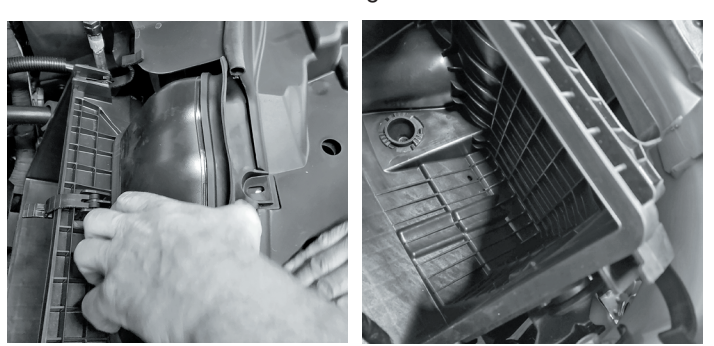
c. Remove the exposed bracket to reveal the in-line connector